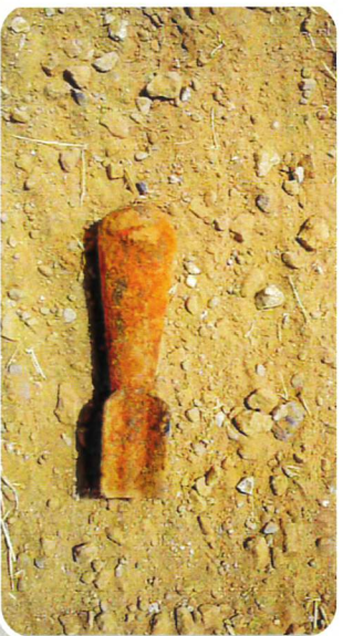
Practice bomb at the former Trabuco Bombing Range

Because explosive hazards associated with military munitions from past military training may remain at the Bombing/Rocket Target, the U.S. Army Corps of Engineers recommends that landowners and visitors follow the 3Rs of Explosives Safety – Recognize, Retreat and Report.